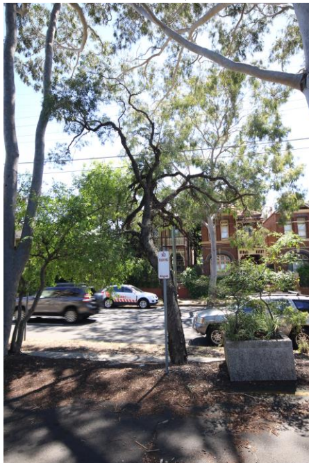
Plate 2 – tree 8

5. The following trees are not impacted by the development works, however their form and lack of vitality warrants removal to provide space for replacement planting: Tree 8 Eucalyptus nicholii (stunted and poor vitality) – refer plate 2 and tree 12 Eucalyptus nicholii (fair vitality but stunted form) – refer plate 3. Note these trees for removal in the TMP;