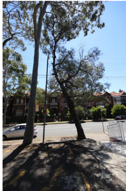
Plate 3 – tree 12