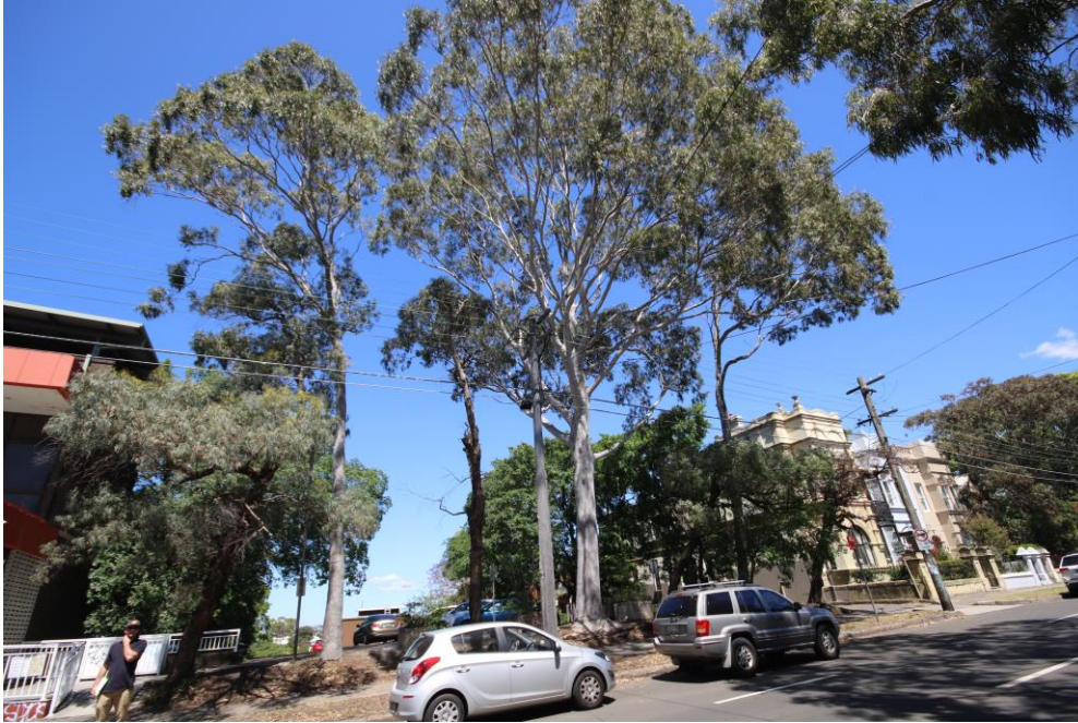
Plate 1 showing trees 11, 9 & 7

4. The following site trees can be retained as the development works have less than 10% encroachment within their TPZ: Tree 7 Corymbia citriodora (good vitality), tree 9 Corymbia citriodora (good vitality) and tree 11 Corymbia citriodora (good vitality) – refer plate 1;